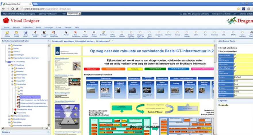
Screenshot of the Visual Designer Web Application in a web-browser.